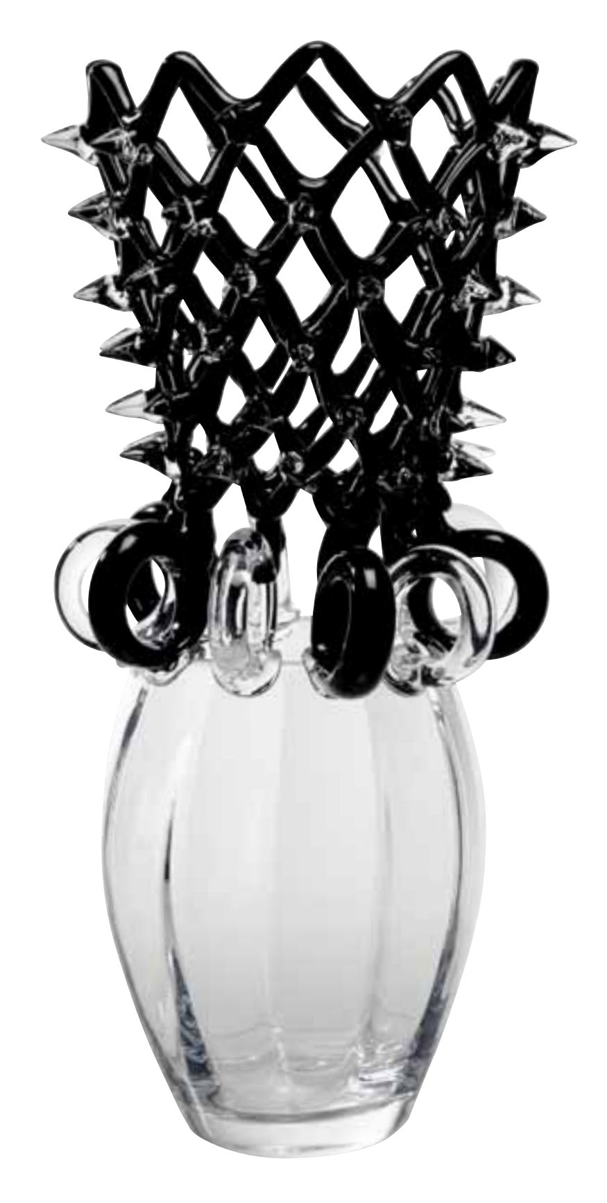
Vase from pure crystal glass with black crystal ornaments h. 56 cm, diam. 21 cm; 5,4 kg Numbered & signed