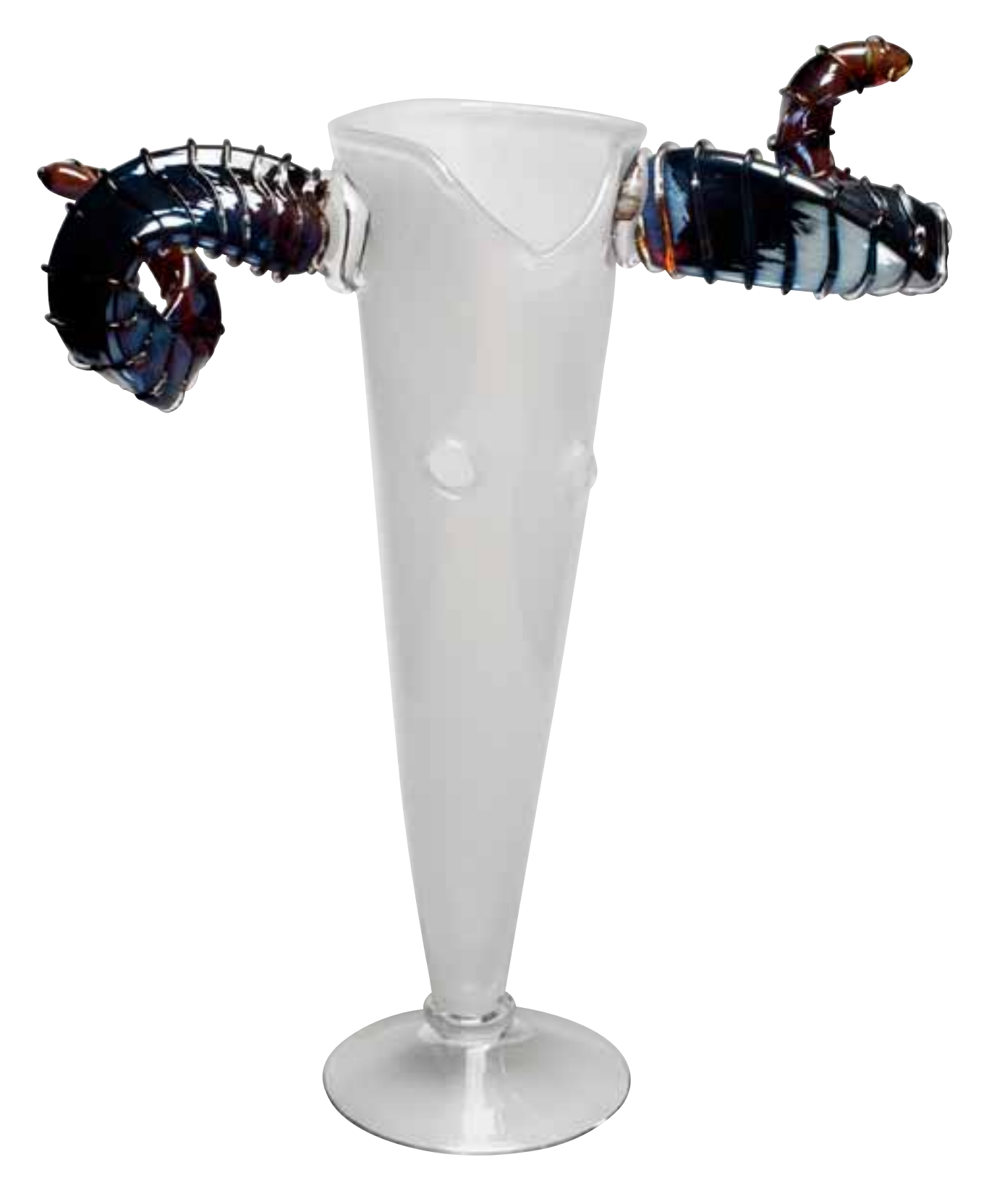
Milky crystal glass vase with two twisted horns from gold crystal - head of a ram h. 50 cm, diam. 50 cm; 4,8 kg Numbered & signed