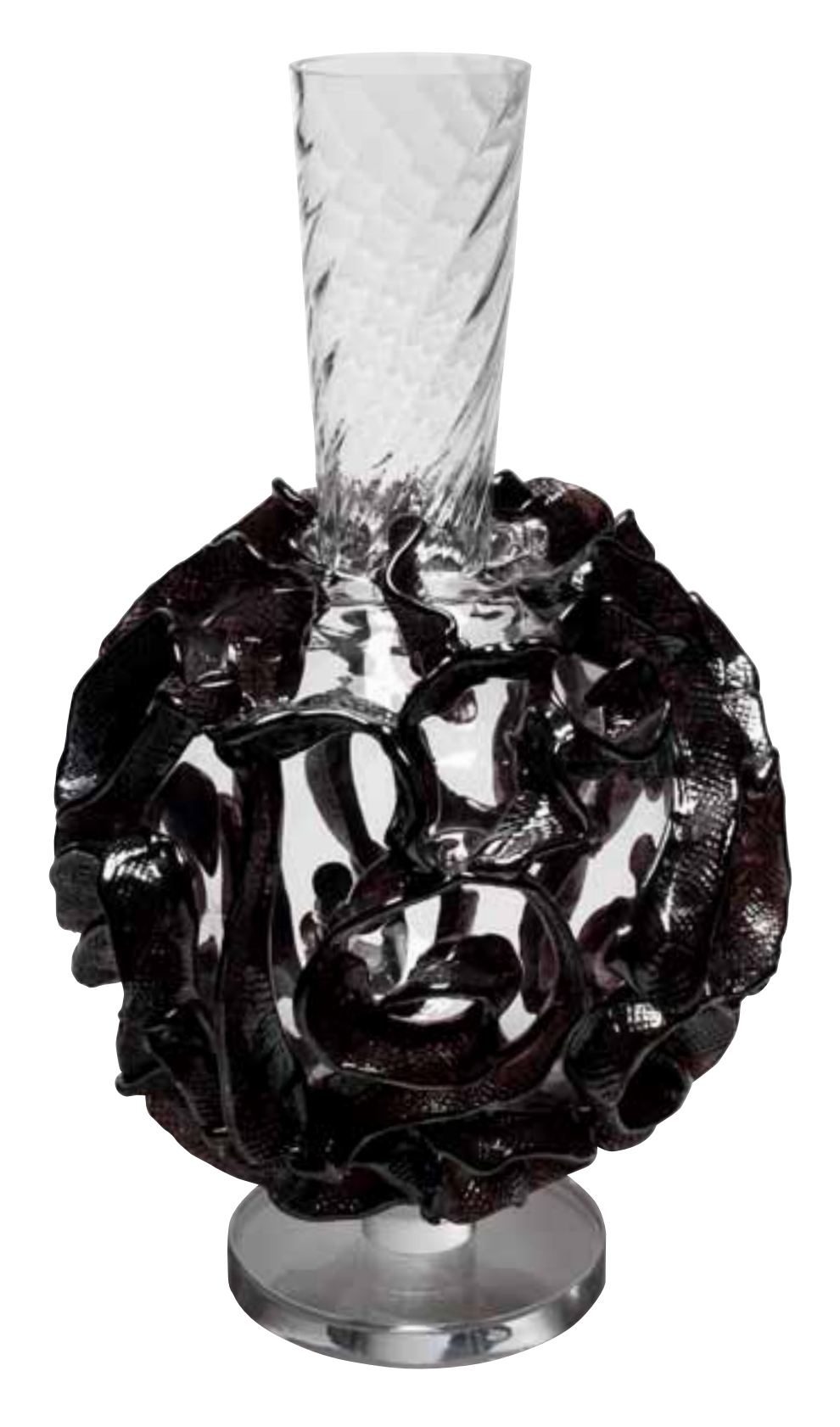
Vase from pure crystal glass with black crystal ornaments h. 48 cm, diam. 29 cm; 7,3 kg Numbered & signed