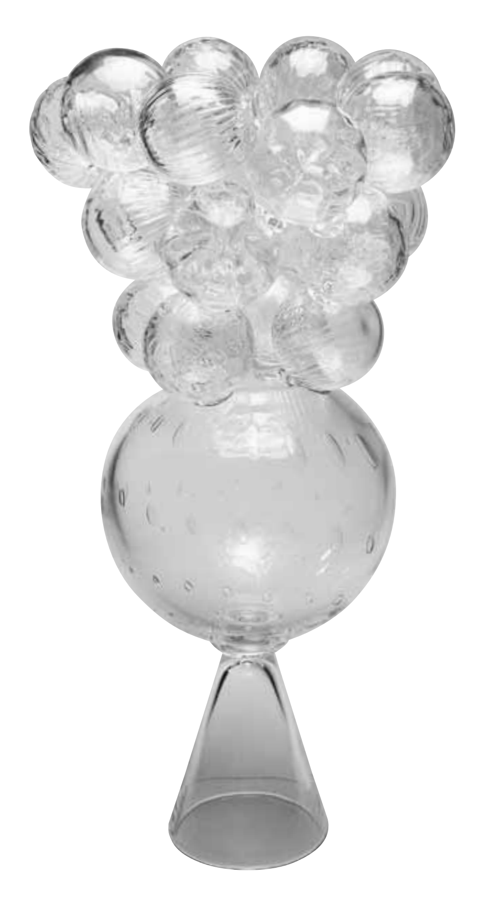
Pure crystal glass vase with pure crystal balls as special ornaments h. 63 cm, diam. 32 cm; 7,7 kg Numbered & signed